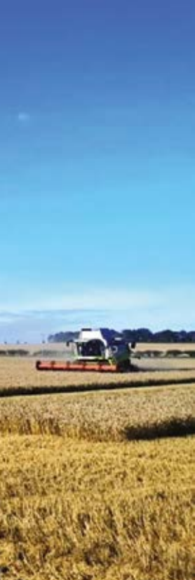
Tackling climate change while still delivering on food production aspirations