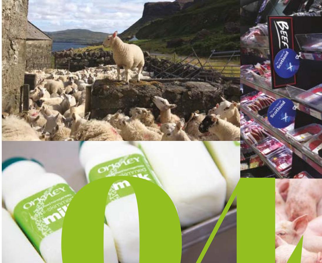
Support and increase diversity of Scotland's rural economy

To deliver on complementary food, climate, and environmental targets and to build resilience for a future generation of farmers and crofters, agriculture must professionalise. To do this, there should be more progressive partnerships between